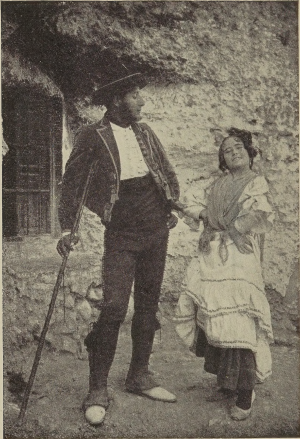
“ A little saint with a color more lightful than orange.”